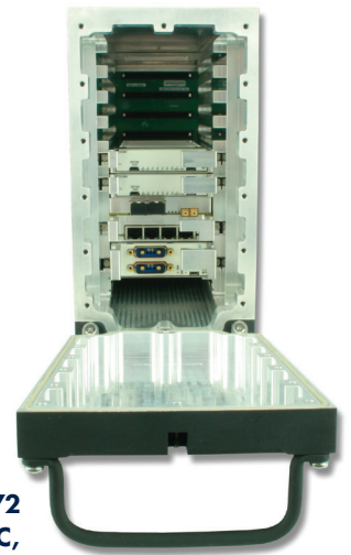
Figure 3: VT872 1U 1/2 ATR Short, 6 AMC, Conduction Cooled

We are experts at reviewing your computing requirements and providing creative, innovative solutions for your application. For more information on the specification and architecture, see the Overview Guide at http://www.vadatech.com/media/article_MicroTCA_Overview.pdf .