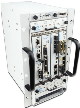
Figure 2: VT899 7U uTCA Cube Chassis, 6 AMC

Energy exploration applications can utilize powerful processors such as the AMC740 72-core Tiler or various Cavium 16 to 32 core processors. There are powerful graphics modules that can be utilized such as an AMC343 2560x1600 @ 60Hz resolution ATI E6760 graphics processor. In another application, an AMC104 PCIe Gen3 carrier was utilized allowing commercial high-performance graphics cards to be plugged into the AMC form factor. High-performance storage is often utilized, including RAID options. Figure 2 shows a cube chassis platform with 6 AMC slots including the Tiler processor, PCIe Gen3 carrier with