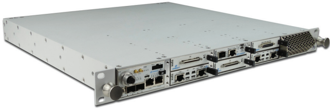
Figure 1: VT950 1U Rugged Chassis Platform

In Communications systems, a common configuration is a 6 to 12 slot 1U commercial-grade chassis with x86 Intel or multi-core Cavium processors, with various network interface cards with GbE and 10GbE ports out the front panel. PCIe is sometimes required, which is a standard option in MicroTCA systems. There are a wide range of options/configurations available in MicroTCA for these types of requirements.